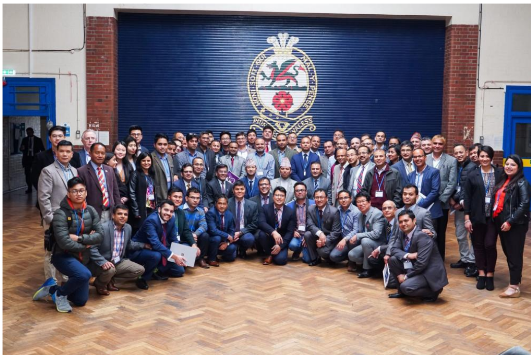
Visit to Institutions of Civil Engineers (ICE)